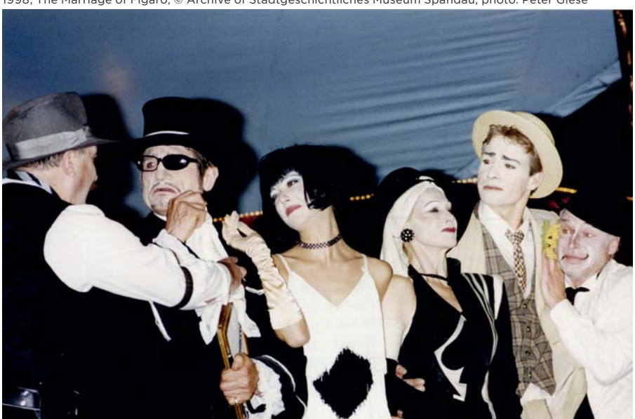
1998, The Marriage of Figaro

When the Kulturhaus took over in 2000, it focused on popular musical theatre. For example, when the Theater des Westens closed for good in 2003, its orchestra gave a guest performance with an adaptation of the musical Falco. Between 2011 and 2018, the diversity of the genre was demonstrated by performances by Musical AG from the Freiherr-vom-Stein-Gymnasium, and by productions by the Musikala ensemble, which specialises in gala performances and productions of well-known classics.