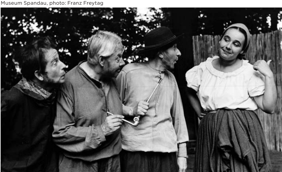
1957, Jan the Wonderful, © Archive of Stadtgeschichtliches

Since 2000, theatre performances have been only a small part of the Freilichtbühne's diverse programme, which now includes comedy, cabaret and other small-scale performing arts.