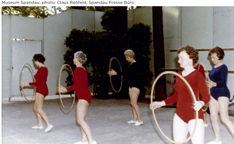
1967, ladies with hoops, gymnastics event, © Archive of Stadtgeschichtliches

Equally popular have been film screenings. In 1992, as part of the Spandau Summer Festival, the theatre partnered with Sputnik Kino, which screened movies after theatre performances. Each performance was a logistical challenge, because before the cinema audience could enter, the theatre audience had to leave. After three seasons, the Spandau organisation Filmriss, which until 1997 also ran the cinema in the Kulturhaus, took over the film screenings. After that, open-air cinema at the Freilichtbühne came to an end.